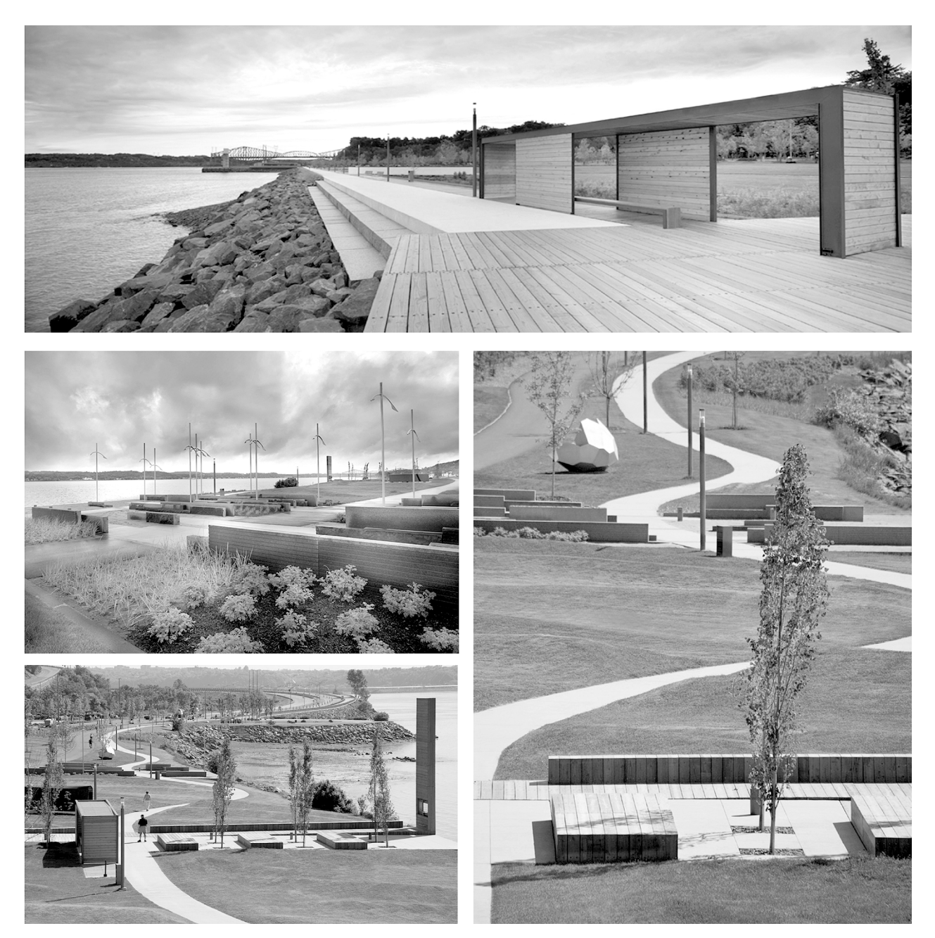
Fig. 2. Design SpaceCity waterfront, 2008. Architect: ConsortiumDaoustLestage + WilliamsAsselinAckaoui. Quebec, Canada [8]

In the second half of the twentieth century, due to the development of industrial design, the situation in the realm of the objective urban spacesfilling began to change radically. Instead of veneer boardwalk kiosks and telephone booths "artisanal" the industrial production forms of telephone boxes, vending machines and multifunctional space moduleswere introduced using the latest, at that time, materials and technologies, and in consequence of it the archaic small architectural forms were replaced by modern outdoor furniture and equipment. That is whya patio furniture became less massive and heavy. This was due to the properties of the new forms of subject as mobility and variability. At that, the design of industrial objective forms didn't contradict the principle of architectural ensemble, but in case of a successful design promoted the composition, stylistic and semanticpreservation of a spatial ensemble holistic structure, itsreinforcement, and, sometimes, allowed to form it anew. A brilliant example a pedestrian streets design can be historic center of many European cities (1970–1980 s), where thestreet furniture and elements of visual communication together with a coloristic decision and landscaping improvement formed an original street style (corporate identity) as a unique spatial ensemble worthremembering. This became a revolutionary moment in the history of the management of city object-spatial environment.