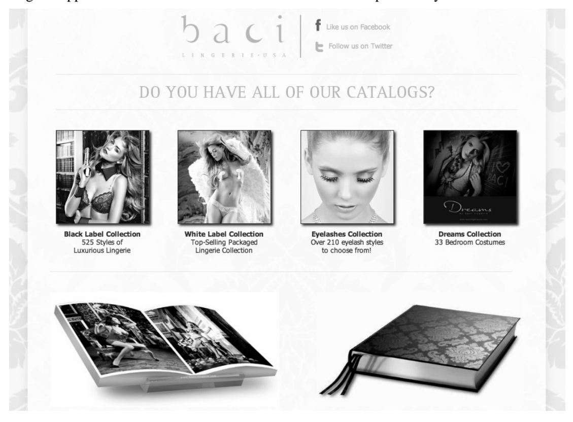
Figure 3. An example of the use of non-conventional codes in the erotic lingerie market Source: [18]

the methodology of Corporate Profiles Consulting – is used to describe the brand positioning [19]. The table clearly shows that the brand archetype is not a closed category and is not finally defined. It offers a whole range of opportunities associated with the formation of brand personality.