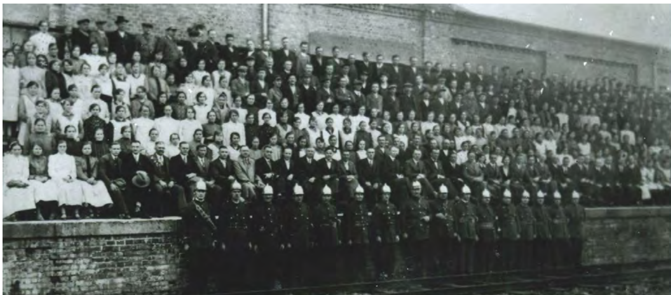
Bierun staff, 1930

During this period Ligoza Co. acquired 24 patents in the United States, Britain, France, Germany, Belgium, Holland, Austria and Finland. Below you will find the full list of the patents, as they are quoted to this day in prior art of 52 foreign inventions, beginning from the fifties and ending with the U.S. patent applications of 2010, and PCT WO 2006. This list does not include Polish patents obtained in the Polish Patent Office in this period.