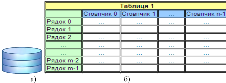
Fig.1. The symbol (a) the structure of the database tables (b).

The relational database schema, which formed a single table is given on Fig.1.