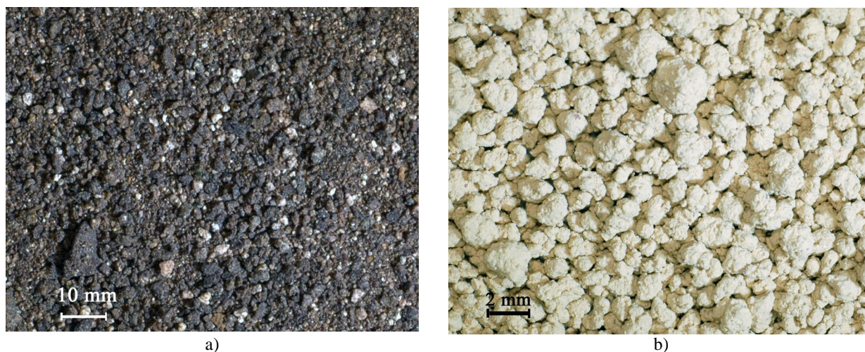
Fig. 1. Appearance of native (a) and saponite mineral activated by hydrochloric acid (b)

To sum up, the first stage of saponite activation is followed by dissolution of iron and aluminum oxides presented in the mineral in the free state, which leads to the largest weight loss over the first hour of the process. The second hour of activation process is characterized by slight changes in the weight due to unbounded compounds which have already dissolved and the destruction of the crystal lattice has not started yet. The next stage is associated with the leaching of aluminum ions from the octahedron crystal structure and can continue to the weight loss which accounts for almost the mass of silicon oxide (IV). As a result, the amorphous silica gel could be formed.