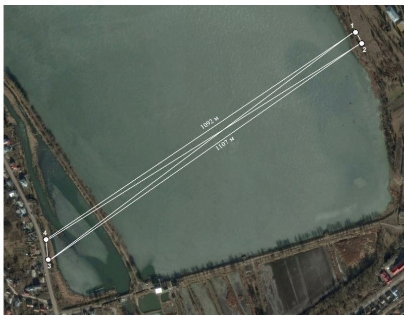
Fig. 2. Layout of the experiment over Berez hany pond

5. Moreover, elevations were calculated taking into account equivalent heights (14) instead of the fluctuations of zenith distances. Equivalent ray heights were determined by (5): along the lines 1-3, 1-4, 2-3 i 2-4 with height equals to 10 m, while along the lines 3-1, 3-2, 4-1, 4-2 heights were equal to 5 m. These elevations were compared to the values of elevations obtained from class II geometric levelling, and the differences are shown in Table 5.