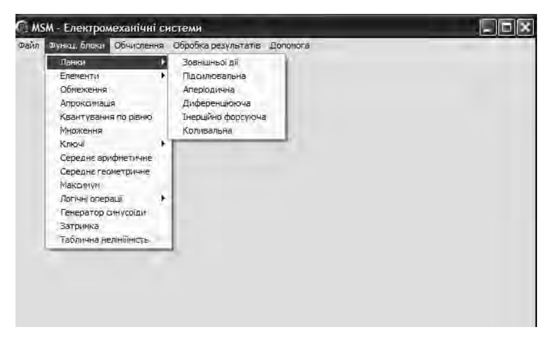
Fig. 3. Window constructing electromechanical system

Results processing unit carries out processing results and output of simulation results. Figure 3 shows the window for building models of electromechanical systems.