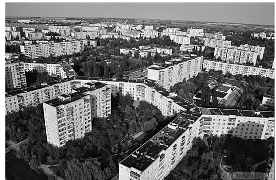
Fig. 9. Lutsk. New residential district 1970s–1980s.

The city ensemble of Lviv centre was enriched with the quarter of new buildings of Lviv Polytechnic (built from 1965 to 1978); the centre city of Ivano-Frankivsk was supplemented by the buildings of the main post office and the theater; Lutsk, Rivne, Ternopil, Uzhgorod received new hotels and department stores with the common design. In the mid-1970s, it became clear that the abstracted, “tied” from the “place” and the cultural context, “typical” architecture proved to be unable to form a complete spatial environment. In this situation, it was logical to apply architectural traditions, especially in those cities where the rich architectural heritage has been preserved. During the period of 1975-1986, state architectural preserves were organized in Lviv, Kamyanets-Podilskyi, Lutsk and Dubno, which included the territory of historical centres.