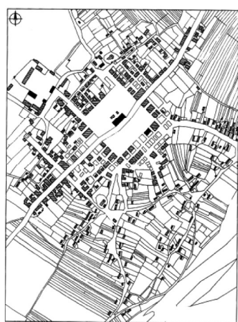
Fig. 1. Skole. Cadastral plan, 1853 [3]

Over the centuries of development of western Ukrainian cities, the diversity of forms of their urban structures (the territory's expansion) has survived to this day. The most characteristic are: – centered plans based on regular plans of medieval cities, for example: Berezhany, Brody, Busk, Buchach, Gorodok, Drohobych, Zhovkva, Zbarazh, Zolochiv, Kolomyia, Lviv, Mykolayiv, Ostroh, Radekhiv, Rohatyn, Sambir, Skole, Ternopil, Truskavets, Uzhhorod, Chernivtsi, Yavoriv (Fig. 1); – linear plans based on the factors of the surrounding landscape, such as: Dubno, Kremenets, Pustomyty, Rakhiv, Skala Podilska, Sokal, Straryi Sambir, Voda Vyshnya, Tyachiv, Yaremcha (Fig. 2); – irregular (combined) plans are developed on the basis of plans that evolved from both of these types and are typical for medium or large cities occupying vast territories, for example: Ivano-Frankivsk, Lutsk, and Rivne (Fig. 3). While preserving the area of historical centres, which continue to be the centres of the city plan, the town-planning structures of these cities over time have changed significantly and have increased geographically.