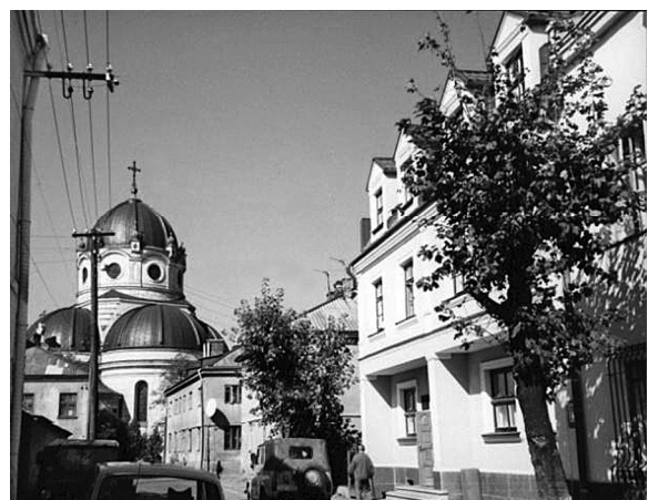
Fig. 13. Zhovkva. City centre, 1995.