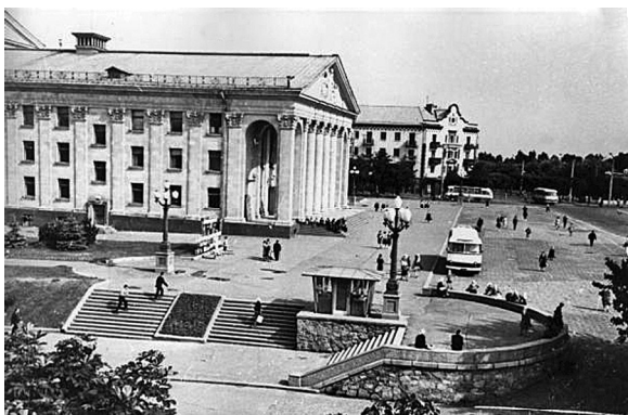
Fig. 6. Rivne. The Theatrical Square. Source: photo by RATAU, 1970

The complex nature of the planning and space-spatial structure preservation of the centre in Chernivtsi determined the main direction of its development in the first post-war decade (Fig. 7). The street network remained practically unchanged, and the building was supplemented by separate buildings – inserts. Their modest classical architectural forms were rather organically combined with eclectic and secessionist forms that prevailed in the construction of Chernivtsi centre [9].