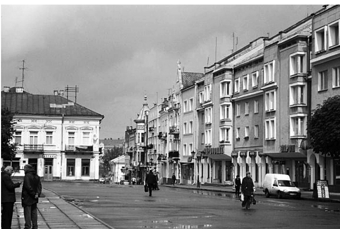
Fig. 12. Drohobych. Market Square, 1985.

Describing the period of the 1980s, the inspiring influence of the cultural regional heritage on the process of composite formation of spatial forms and architectural details has been immense. In the cities of Western Ukraine, the process of construction “sealing” often contributed to the restoration of the planning structure and spatial form of previously lost traditional urban neighborhoods (Fig. 12, 13). Extensive searches for regional forms based on local traditions of the 1980s gradually changed into “new eclecticism” of the 1990s due to the effects of commercial mass culture. Radical socio-political and economic changes which took place in Ukraine in 1991 significantly changed the conditions of urban development activities. Forms of ownership changed, and the abolition of lots of Soviet-era constraints led to a huge “explosion” of residential housing in cities. Unfortunately, the architectural image of the cities in western Ukrainian regions generally suffered heavy losses.