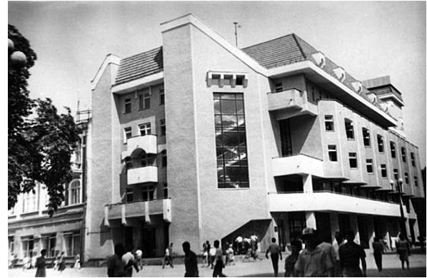
Fig. 7. Ivano-Frankivsk. New office and apartment buildings, 1985.

In large cities, two diverse city images were developed: 1) the image of the historic city centre with architectural monuments; 2) the image of new industrial and massive multi-storey residential developments. Industrial nodes and new residential areas have become self-sufficient elements of urban space with their own “industrial” architectural image, due to the wide use of large-panel structures. The designs of new residential areas in Lviv, Lutsk, Ivano-Frankivsk, Rivne, Ternopil, Uzhhorod, and Drohobych are good illustrations of the idea.