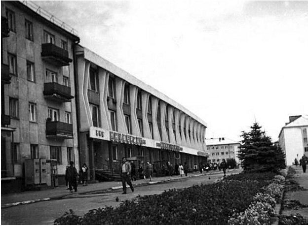
Fig. 10. Brody. New buildings in historic city centre, 1980.