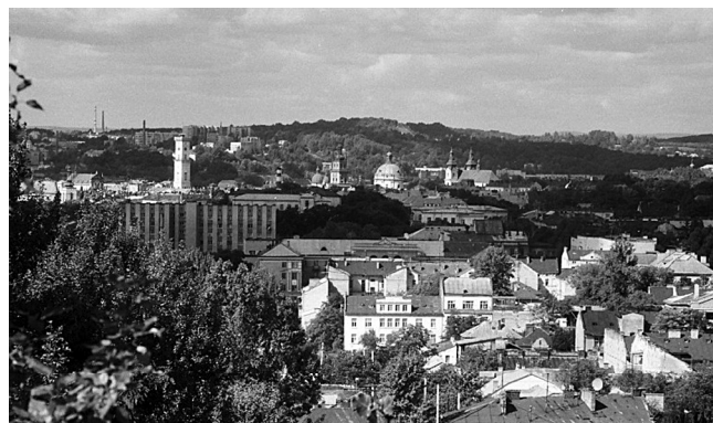
Fig. 7. Lviv. The general view of the city centre.

A similar city-building situation has developed in the centre of Uzhhorod. The city was not ruined, its core – a spatial structure of the centre remained in the complex, only some elements of needed renovation. Small architectural forms were set up in small streets and squares, decorative herbalsists and flower beds were formed.