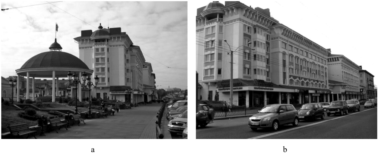
Fig. 14. Rivne. New complex with a rotunda (a); Rivne. Street view. Source (b): photo by B. Posatskyy, 2008

Against the background of chaotic changes in the appearance of cities in Western Ukraine at the beginning of the 21 st century, the city of Rivne has gained certain exceptions in that respect. Its purposeful development of architectural image has followed its master plan of 2003. It defines a landscape framework development of Rivne along the Ustya River (north-south direction) and the urbanist framework to the east-west direction. The street of Soborna was formed as the result of the city-building concept of a new public complex along the main highway in the western part of the city [16].