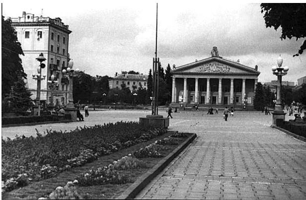
Fig. 4. Ternopil. Central Square with the theatre, 1955.

At the same time, in most of the cities centres of Western Ukraine, there was no broad potential for the creation of new ensembles, as they retained a rich historical and architectural heritage in one form or another. Forming the spatial structure of city centres, the monuments of urban planning and architecture significantly restricted the possibility of creating new ensembles. Accordingly, the requirements for a new image creation of the cities centres in an expanded form could only be carried out in those cities where the existing urban situation allowed for radical spatial transformations. Favourable preconditions for this were formed in Ternopil, Lutsk, and Rivne in 1945. Ternopil is a typical example, where an architectural-landscape system was formed in the city center during the post-war reconstruction of 1945-1955. It is marked by the unity and harmony of natural and architectural forms, is organized in space in accordance with the unified artistic conception that creates a rich and interesting architectural image. The reconstruction of Ternopil centre began on the basis of the general plan scheme of 1945, and then continued in accordance with the general plan of 1954, which provided the formation of new ensembles in the destroyed territory of the city centre. The basis of the space organization concept for both plans was the idea of creating a system of greened areas, squares and boulevards in the center of Ternopil in 1945–1955 (Fig. 4) [5].