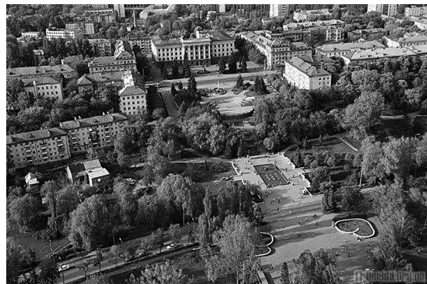
Fig. 5. Lutsk. Central square, 1955.

A post-war formation of a new city center in Lutsk took place somewhat differently. It was decided to transfer the new city centre to a new territory near the historical centre, which did not undergo significant military destruction. The first post-war general plan of Lutsk provided for the formation of a new urban centre system in the form of two squares, connected by a new main street on the shore terrace of Styr.