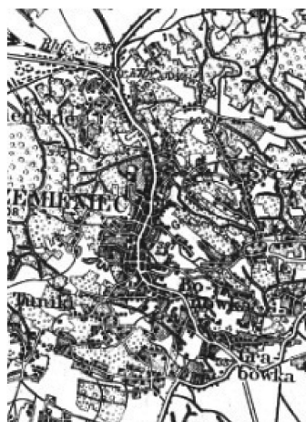
Fig. 2. Kremenets. Town plan, 1853