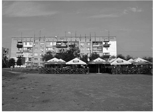
Fig. 11. Rava-Ruska. New building in historic city centre, 1980. Source: photo by B. Posatsky, 2015

The situation changed in the early 1980s under the influence of the critique of functionalism and the transition to postmodernist conceptions of the architectural and urban-type forms of creation. A wide variety of stylized architectural forms were widely distributed, designed to “decorate” and “regionalize” the building image. Similar decisions have gained much of popularity in the construction of the resort towns such as Truskavets, Morshyn, and Yaremche. The spatial forms of postmodern architecture of various design found their application in numerous buildings constructed on the site of amortized building. In this respect, the characteristic features have the centres of Drohobych, Ivano-Frankivsk, Lviv, and Zhovkva, where new buildings are organically fitted into the historical context.