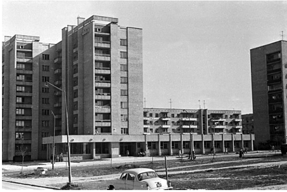
Fig. 6. Lviv. New apartment buildings, 1970.