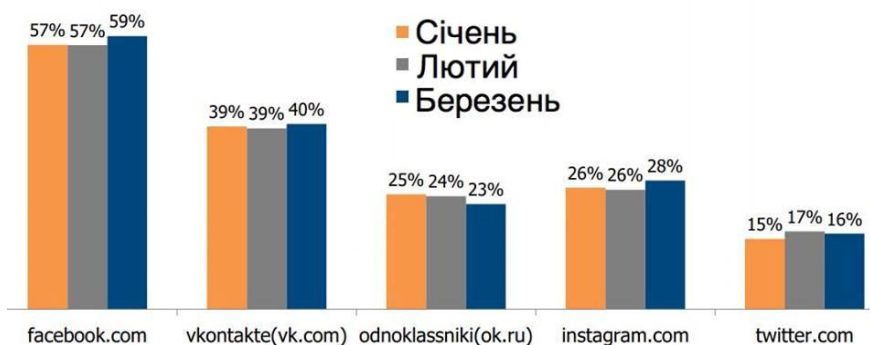
Usage of social networks by Ukrainians (January–March 2018)