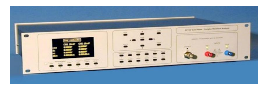
Fig. 1. Multifunctional gain-phase analyzer Clarke Hess 2505