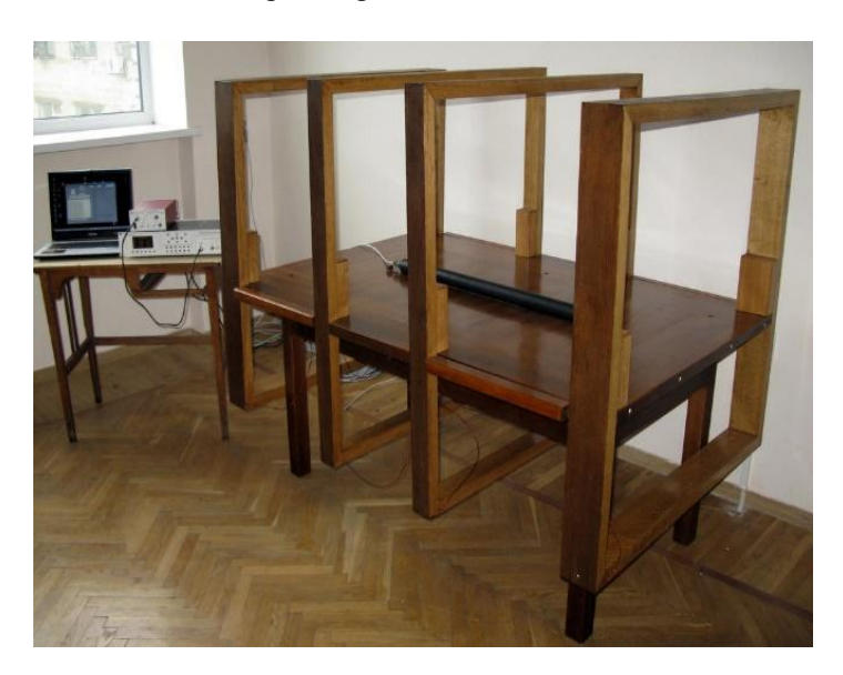
Fig. 3. Laboratory installation for analysis the Helmholtz coils using the multifunctional gain-phase analyzer