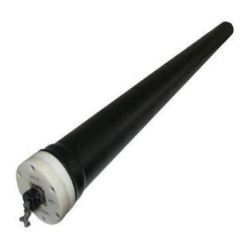
Fig. 2. Magnetometer LEMI-120