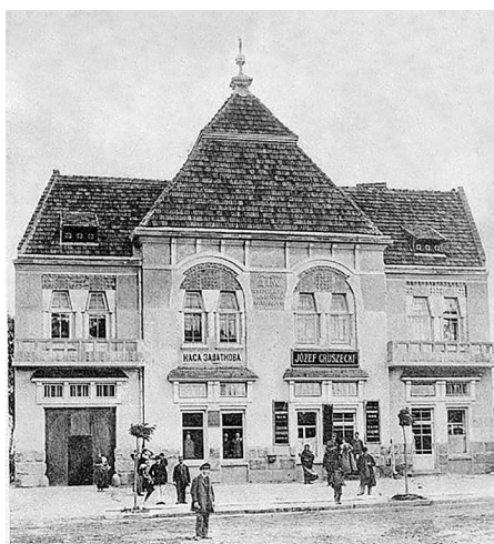
Fig. 1. People's House in Kamianka-Buzka. (Tsentris'koyi istoriyi Tsentral'no-Skhidnoyi Yevropy. People's House in Kamianka-Buzka . [online] Available at: < http://www.lvivcenter.org/uk/uid/picture/?pictureid=4251 > [Date of reference 10 April 2020])

People's House in Kamianka-Buzka (Fig. 1), built by I. Levynskyi's firm under the project of O. Lushpynsky in 1911–1912, also has a rich theatrical history. The architectural expressiveness of the building is enhanced by the embellished plasticity of the walls, complemented by friezes and inserts of greenish-blue majolica tiles, and a sophisticated central risolite. On the second floor, twin windows with sloping corners, a significant element of Ukrainian modernism, were used, which became widespread in Central and Eastern Ukraine and has just begun to take root in the Western region. The high expressiveness is gained owing to the high roof in the form of a four-slope tent. Despite its small size, this house is monumental and harmonious with respect to the person it dignifies rather than inhibits. In 1914, the actors of the Ukrainian Theater "Ruska Besida" staged the drama "Ukradene Shchastya" by Ivan Franko at the People's House. The legendary Les Kurbas was in the cast.