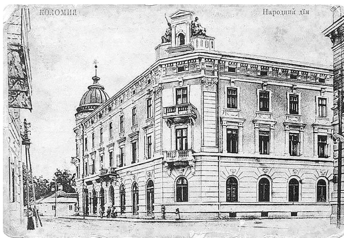
Fig. 2. People's House in Kolomyia. (Natsional'nyy muzey narodnoho mystetstva Hutsul'shchyny ta Pokuttya. Kolomyia. People's House. Postcard of the early twentieth century . [online] Available at: < http://hutsul.museum/museum/history/overview/ > [Date of reference 11 April 2020])

At the beginning of the 20th century with the rapid rise of theatrical art in Lviv and Galicia, a large number of dramatic groups have been established. This gave impetus to the change of planning decisions of cultural and educational buildings, and then almost every one of them provided space for theater auditorium.