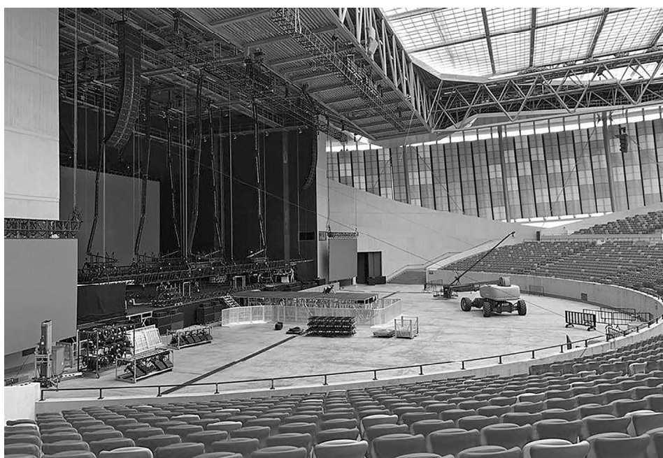
Fig. 3. Stage and amphitheatre space. Black Sea Arena in Shekvetili.