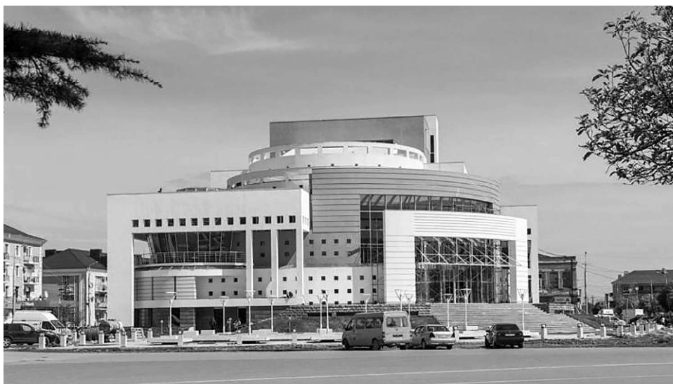
Fig. 2. General view V. Gunia Poti Drama Theatre.