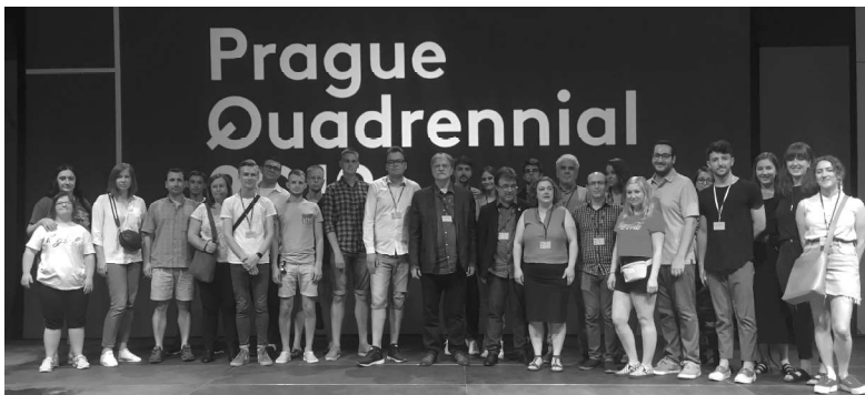
Fig. 3. Delegation of the Department of Architectural Environment Design with the Canadian and Georgian colleagues at the Krizik Pavilione Palace after the PQ Talks on June 7, 2019 at 2:00 pm.