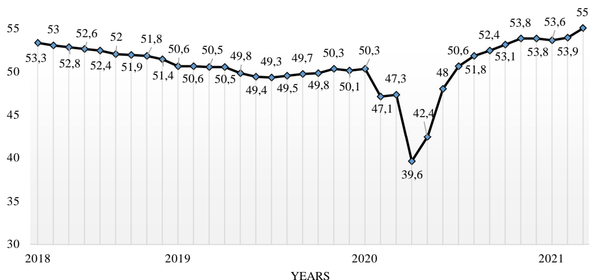
Fig. 4. Dynamics of global PMI change from April 2018 until March 2021. [17]

in global PMI, starting from April 2018 until March 2021.