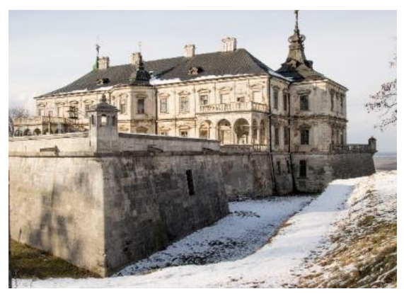
Fig.14. Echauguette on the bastions of Pidhirtsi castle

The castle in Zhovkva is well-preserved and renovated. It is a registered National monument under №1928 (385/0). From 2012 to 2015, the Ministry of Culture and National Heritage provided targeted subsidies to implement a research program in Zhovkva castle. Those funds were given to conduct research and detailed documentation of preserved remains of the historical interior of Zhovkva castle (Pyzel, 2015). The castle is connected compositionally with the fortified town. Reconstruction of roofs and façades and renovation of the entrance was made in 2003. In the same year, residents of the apartments in the castle, which had lived there since the 19th century, were transferred to other places. Since 2008, several restoration works have been done on the palace building and the inner bailey<sup>5</sup>.