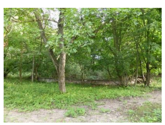
Fig.11. Stone frame around the lake in Murovane of Pustomyty District in Lviv Region

It is possible to state that one floor was added in corner avant-corps, and their top was changed somewhen after 1939, comparing fig. 7 of this period with the current state (fig. 12). Also, the roof and windows were altered. Furthermore, the pilasters were added. Unfortunately, there is no exact date when those changes occurred.