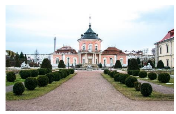
Fig.15. The inner courtyard of the bastion castle in Zolochiv

The main palace is a two-story rectangular building under a hipped roof in the western part of the complex. The corners of the palace are decorated with rustication on the entire height. The Chinese palace is located on the central axis from the main gate (fig.15). It consists of a two-story rotunda in the middle with two one-story corps on both sides. An eight-column portico forms a balcony on the second floor in the central part of the palace. A conical roof covers the central part of the Chinese palace.