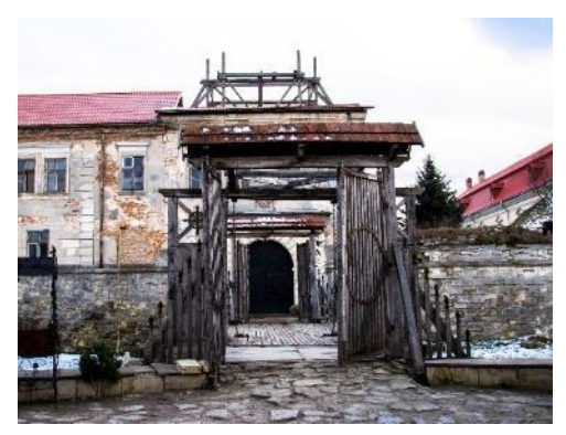
Fig.16. Drawbridge of Zolochiv bastion castle