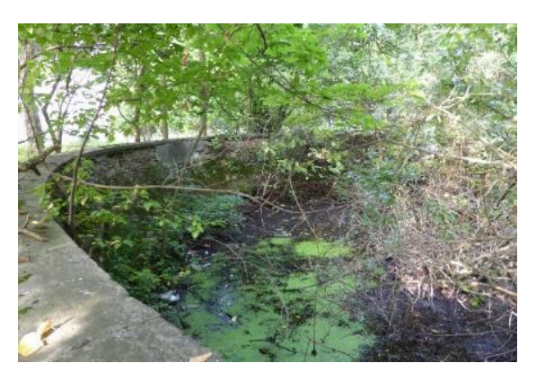
Fig.10. Stone frame around the lake in Murovane of Pustomyty District in Lviv Region

A reconstructed palace in a whole volume remained in the bastion castle in Murovane of Pustomyty District . The road to the castle is steep and passes through the park with old linden trees. Also, a stone frame of the lake remained on the castle territory (fig.10,11). Nowadays, the palace stays without any function and needs restoration works (fig.12).