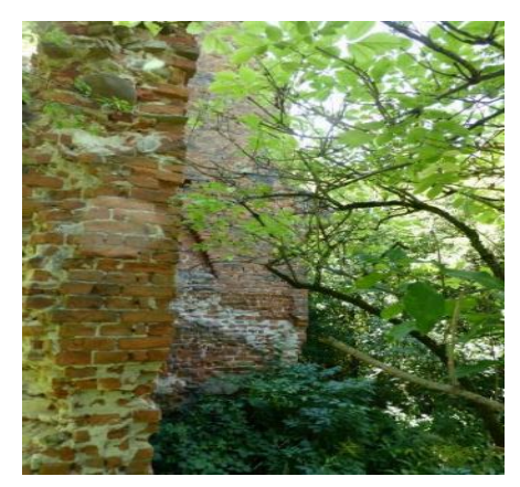
Fig.8. Remains of Murovane Castle (Sambir District) fortifications