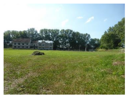
Fig.3. Football field with earth defensive wall

Before analyzing castles in Murovane , we need to make some clearness. First, neither of those sites are registered monuments. Moreover, the author of this work was faced with the situation of mixing the facts of those two castles by other scholars.