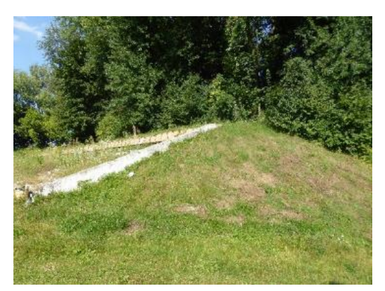
Fig.2. Football seats located on the bastion of the castle in Komarno

The bastion castle in Komarno is an unregistered site, although its earthworks, namely the whole bastion outline, are well preserved and situated next to the exit to the road towards the village Peremozhne. Today the castle is used as a stadium, "Gazovyk," with a football field in the castle courtyard (fig.2, fig.3). The stadium stands are situated on a rampart of earth bastion fortifications. The underground remains of bastions are visibly well-traced. Nearby is a modern brick building. Today it uses as the city hospital.