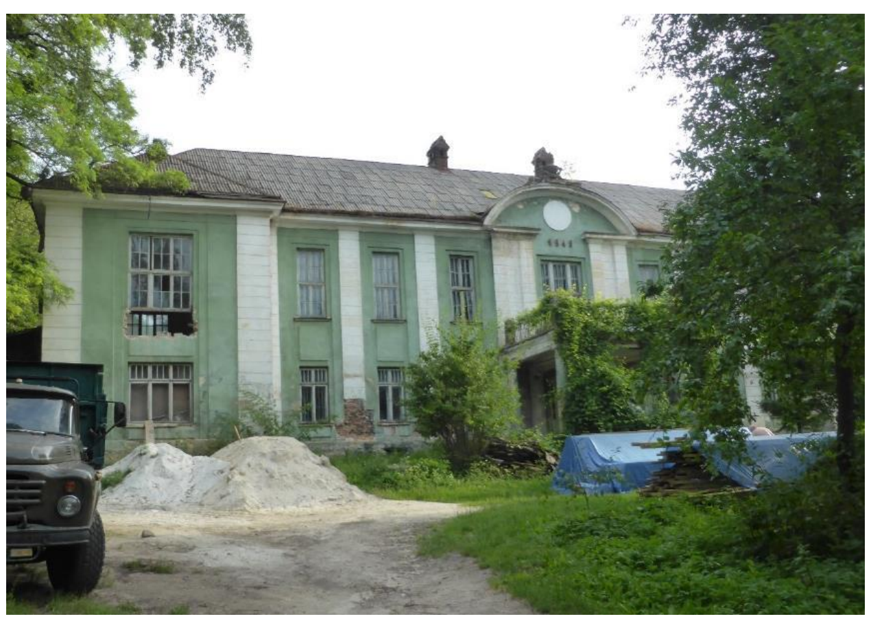
Fig.12. Palace in Murovane of Pustomyty District in Lviv Region.