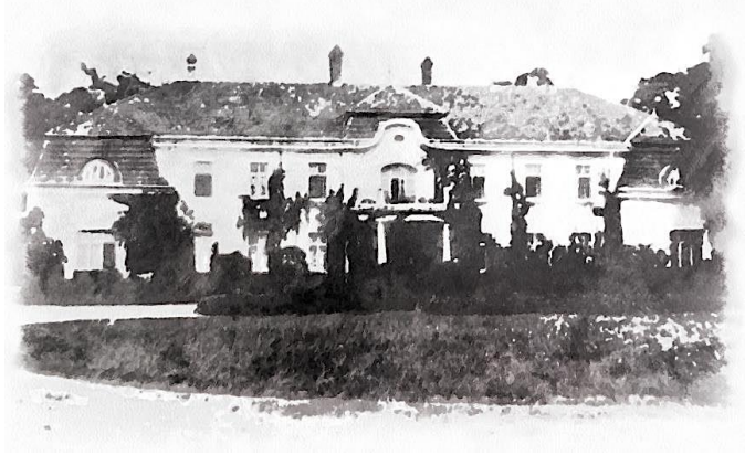
Fig.7. Digital watercolor illustration showing the palatial part of bastion castle in Lashki Murovane of Pustomyty District in Lviv Region in 1939 based on photo in (Aftanazy, 1991, p. 351) (Author's work)

Until nowadays, only small fragments of fortification walls with steep slopes and deep moat and remains of the canal, which was used to fill the ditches, survived in the Murovane bastion castle of the Old Sambir District (fig.8)