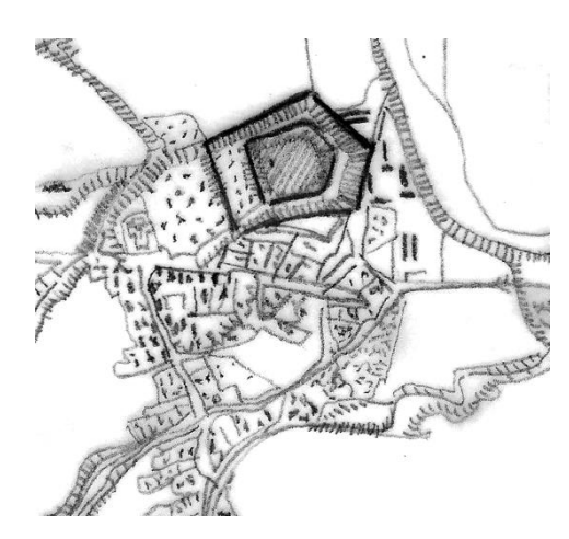
Fig.5. Scheme showing the castle in Lashki Murovane of Old Sambir District based on the map from 1869 (mapire.eu) (Author's sketch)

The clearness about possible confusion with those two castles' localization and history is firstly made in this research, using the analysis of the description of geographical localization of two of them and comparison of these data with cartographic materials from the First Military Survey (1763-1787) and Second Military Survey (1806-1869).