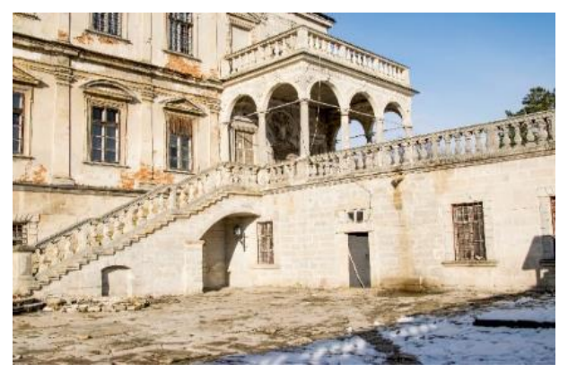
Fig.13. Photo of the terrace that is formed by casemates in Pidhirtsi bastion castle