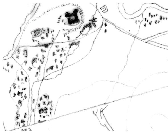
Fig.4. Scheme showing the castle in Lashki Murovane of Old Sambir District based on the map of F. VonMieg,1781 (Galizien und Lodomerien, 2020) (Author's sketch)