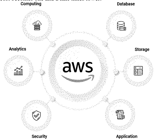
Fig. 1. Services included in the AWS complex

The cost of the service is paid for each hour, and some options are paid on a monthly basis. If the client plans to use EC2, then it is recommended to use the reservation function. The subscriber pays for 3 months of work at once, and the total cost becomes one and a half times lower.