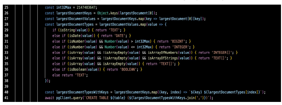
Fig. 3 Example code to determine the type of a column in a database table