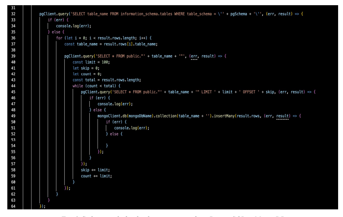
Fig. 2 Code example for database migration from PostgreSQL to MongoDB