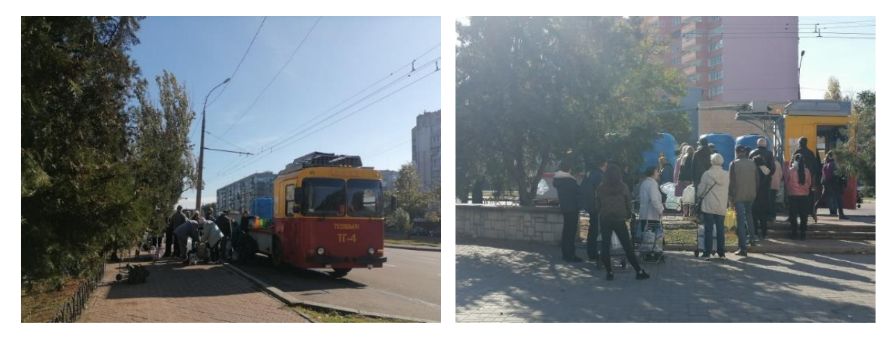
Fig. 2. The city's drinking water supply under wartime conditions

Thus, the main sources of the city's drinking water supply under wartime conditions, when the main water supply "Dnipro-Mykolaiv" was destroyed, were: first, wells located on the territory of the private sector, some enterprises and institutions; secondly, imported water from other cities; third, bottled water. Typical water features of the city of Mykolaiv are shown in the photo, Fig. 2.