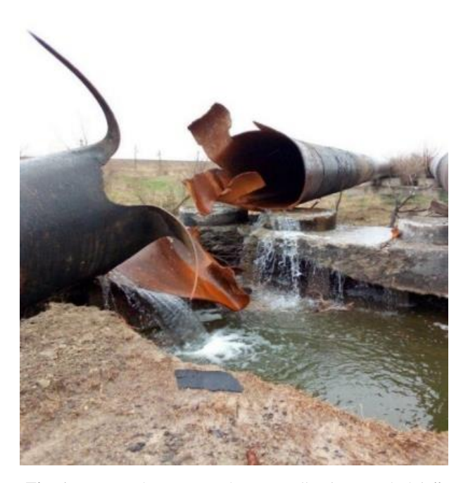
Fig. 1. Damaged water supply system "Dnipro-Mykolaiv" in the territory of the Kherson region, 2022

supply system of Mykolaiv city during 2022 are presented in the Table 1.