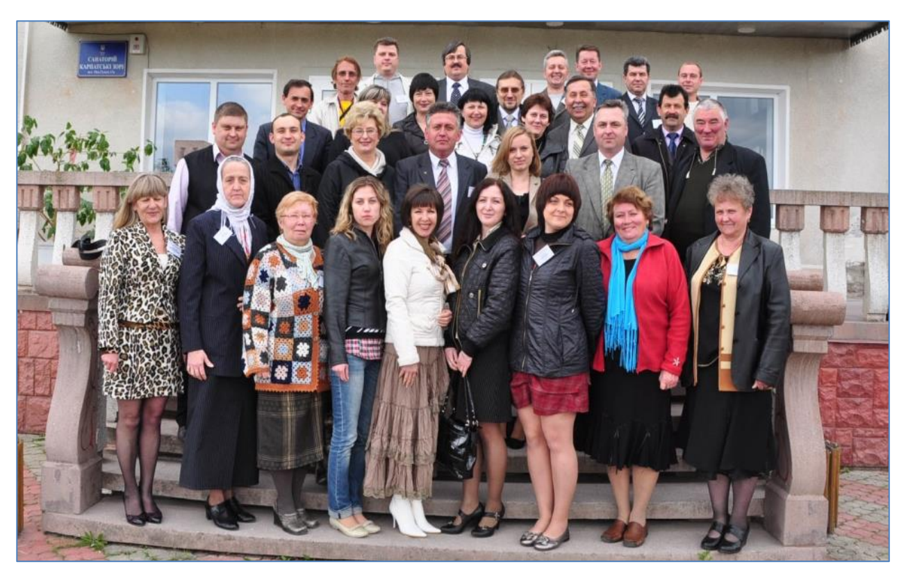
Fig. 1. Circle of participants of the first thematic Carpathian school (July 2011, Kosiv)

It is understood that the ambitious Sustainable Development Goals of Ukraine (SDG in Ukraine) need to be supported by the appropriate human resources (Environmental Portrait, 2018; Khymynets, 2013). The Carpathian School is an educational project established in 2011 in the Kosiv community of the Ivano-Frankivsk region. The idea was initiated by representatives of local public associations, including members of the regional charitable organization "Centre of Public Initiatives," and teachers from educational institutions in Kosiv district of the Ivano-Frankivsk region (Fig. 1).