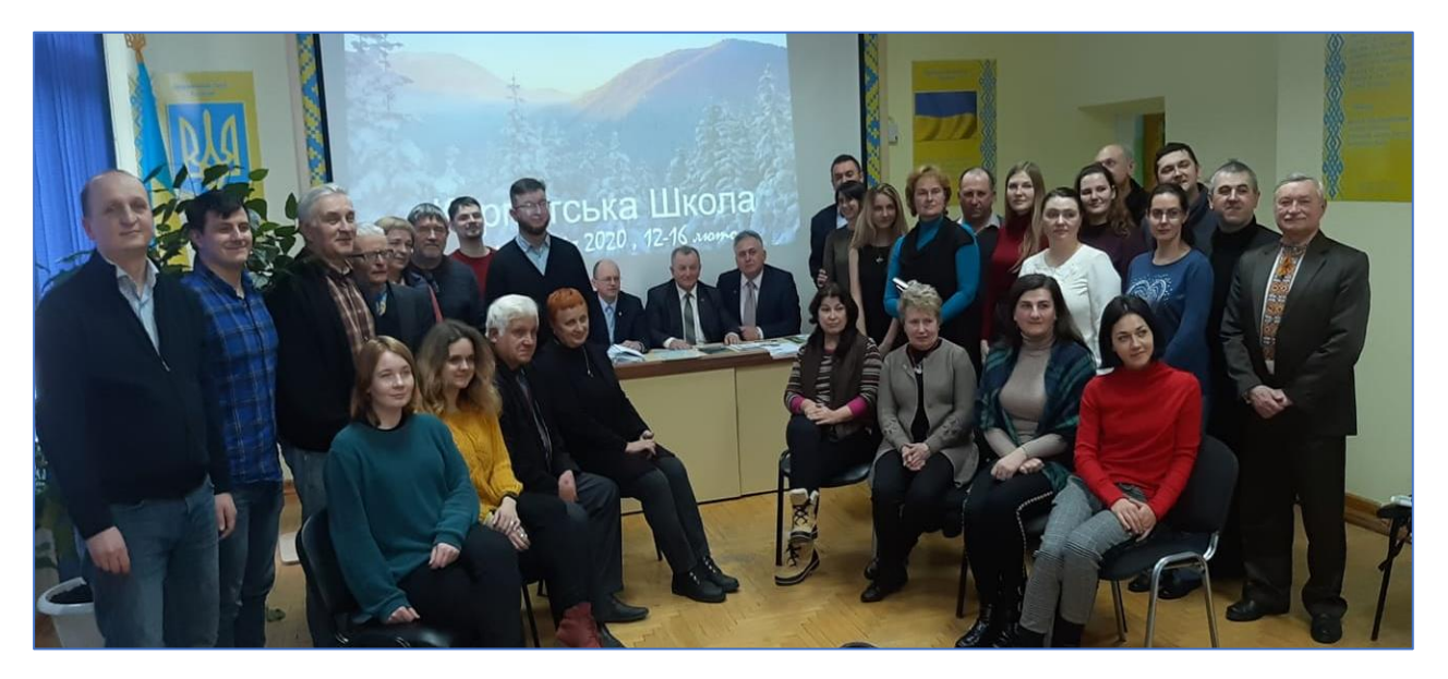
Fig. 6. Participants of the Carpathian School 2020 at NPP "Vyzhnytskyi"

Ukraine are also actively discussed. These mutual relations can create a new communication platform for researchers from these countries.