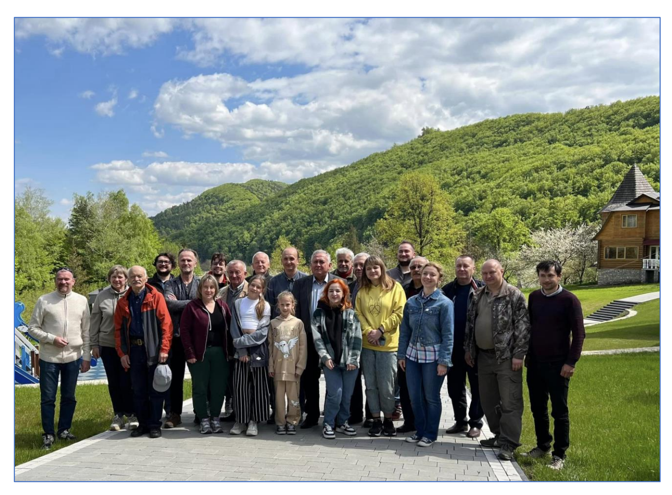
Fig. 7. Participants of the spring session of the Carpathian School of 2023 – representatives of the National Ecological Center of Ukraine

need to realize new perspectives for the sustainable development of the Carpathian region and enhance international environmental cooperation at the community level (Fig. 7). Therefore, it is essential to further establish multilateral cooperation and expand the number of partner institutions. It is also important to popularize and support Ukrainian folk art, preserve the cultural traditions of the region, encourage young people to continue these age-old traditions, care for the preservation of nature's beauty, purity, and resources, and improve the cultural and educational environment.