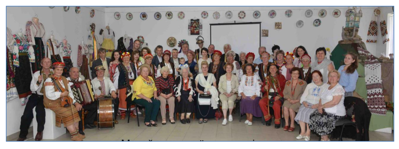
Fig. 2. Carpathian Summer School of Ethnodesigne (July 2018, Kosiv)

The content of the training manuals was adapted to the Ukrainian audience and involved providing teachers with methodological materials that clarified the multi-disciplinary approach to teaching topics such as climate change, conservation of natural resources, ocean protection, waste management, etc. Experts from the International Organization "Green Dossier" in Ukraine assisted in conducting practical sessions with teachers on household waste management (Fig. 3).