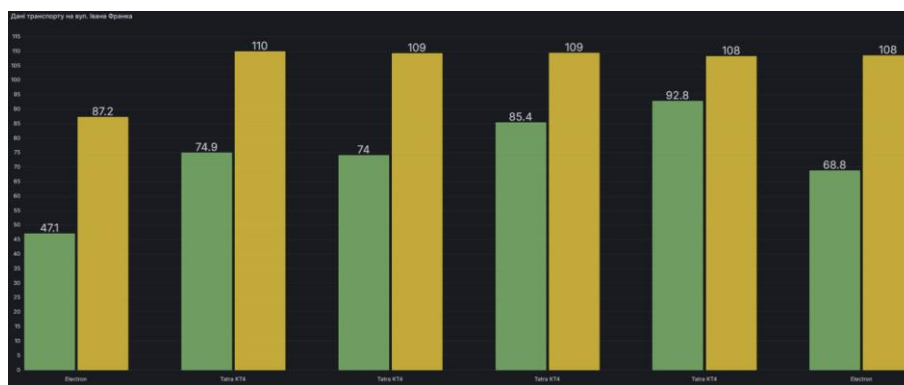
Fig. 3. Grafana Example Visualization For Ivana Franka Street

The presented workflow, UML diagram, and Grafana visualization collectively demonstrate a robust AI-driven system for noise pollution monitoring. By integrating data collection, processing, and visualization, the system provides accurate insights into noise levels from urban transport sources. This enables targeted interventions, such as modifying vehicle operations or implementing noise reduction measures, supporting smarter, more sustainable city planning.