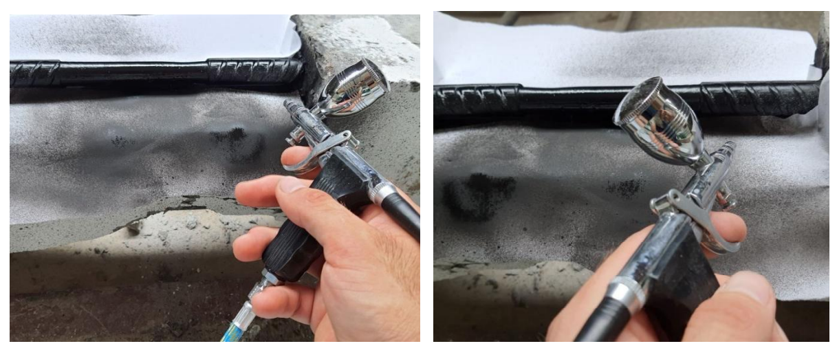
Fig. 3. Application of speckles on the reinforcement using an airbrush