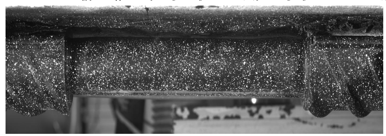
Fig. 6. Applied speckles on reinforcement

For the study and determination of deformations in the tensioned thermally-strengthened reinforcement and concrete within the pure bending zone across the entire height of the cross-section, two monochromatic "Grasshopper 3" cameras from Flir (Canada) equipped with Computar F25/2.8 lenses were used. The first stage of testing with the use of cameras began with mounting them on a tripod in the designed position and adjusting the parameters. The overall setup of the cameras is shown in Fig. 7.