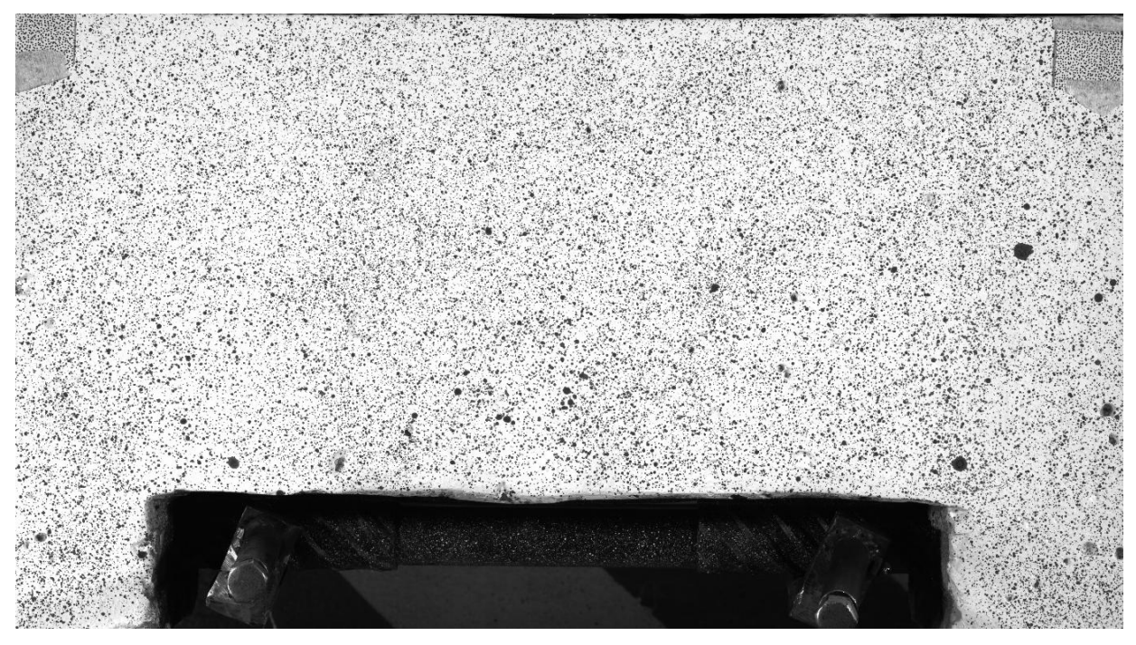
Fig. 5. Applied speckles on concrete