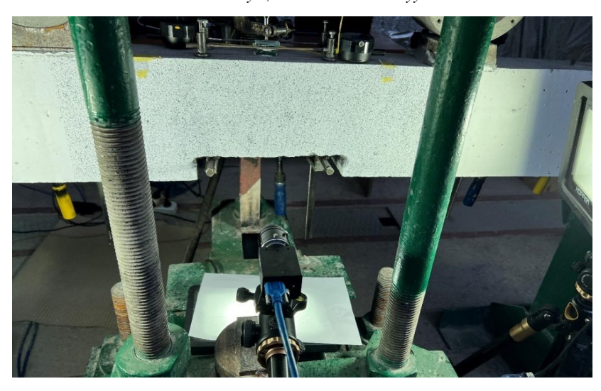
Fig. 8. Camera for capturing images of concrete deformation