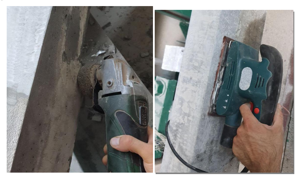
Fig. 1. The process of leveling and cleaning the surface of concrete and reinforcement

movement of individual matrices, taking into account all errors and corrections. Before the test, the samples were prepared by grinding uneven surfaces of the concrete, cleaning off dust, and brushing the reinforcement (see Fig. 1).