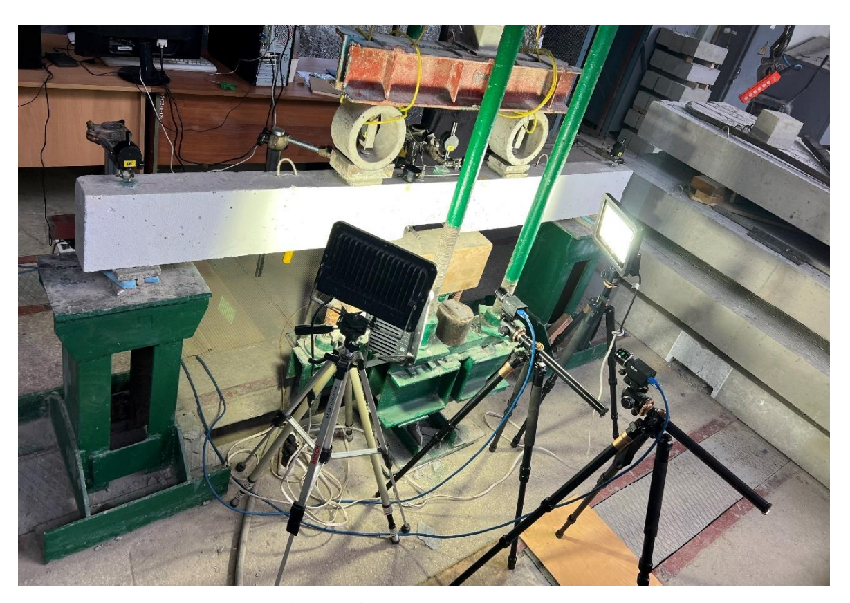
Fig. 7. Overall view of the camera arrangement for image capture

For the study and determination of deformations in the tensioned thermally-strengthened reinforcement and concrete within the pure bending zone across the entire height of the cross-section, two monochromatic "Grasshopper 3" cameras from Flir (Canada) equipped with Computar F25/2.8 lenses were used. The first stage of testing with the use of cameras began with mounting them on a tripod in the designed position and adjusting the parameters. The overall setup of the cameras is shown in Fig. 7.