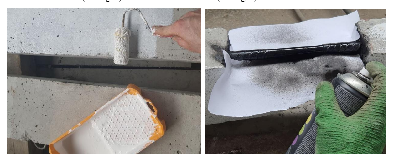
Fig. 2. Application of a white background on concrete (left) and a black background on reinforcement (right)

The optimal speckle diameter of 0.2–0.4 mm was determined based on the pixel count of the camera and the distance to the study area. A lime-based paint was used for the white background on the concrete, providing more accurate results due to its absorption into the surface rather than forming an elastic film. The paint was applied with a roller in two layers: the first thinner and the second thicker (see Fig. 2). The speckle pattern of black dots was applied to the concrete using a controlled splatter technique with stiff brush bristles and a needle, along with water-based black ink as the coloring agent (see Fig. 4). The optimal speckle diameter on the concrete was calculated to be 0.3–0.7 mm. The applied speckle pattern for the DIC method is shown on the concrete (see Fig. 5) and on the reinforcement (see Fig. 6).