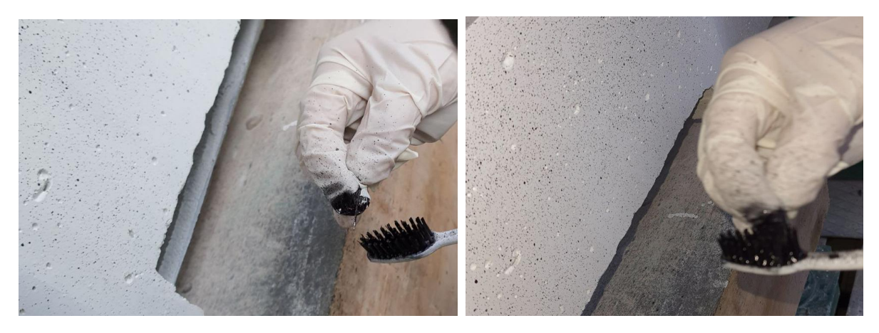
Fig. 4. Application of speckles on concrete using the spraying method