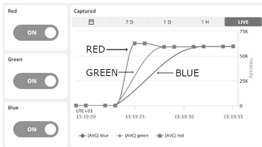
Fig. 4. Arduino Cloud Dashboard with all RGB channels on.