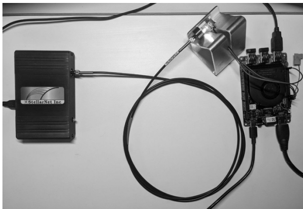
Fig. 3. Experimental setup with LED on

The script uses the pyFirmata library to interact with the Arduino Leonardo's digital pins (D9, D10, D11) from the Latte Panda. Each pin corresponds to one of the RGB LED channels. When a cloud variable is toggled, the associated callback function updates the pin's output state, turning the corresponding LED on or off (Fig. 3).